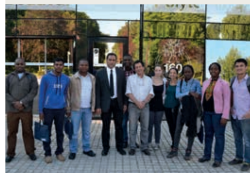
Testimonies of the first promotion: www.lasalle-beauvais.fr

AMONG COMPANIES AND INSTITUTIONS THAT SUPPORT US: FLORIMOND-DESPREZ, LIMAGRAIN, MAÏSADOUR, SAATEN-UNION, SECOBRA, SYNGENTA, BAYER, BASF, UNISIGMA, BONDUELLE, PERNOD-RICARD, TEREOS / INRA, CIRAD, ARVALIS.